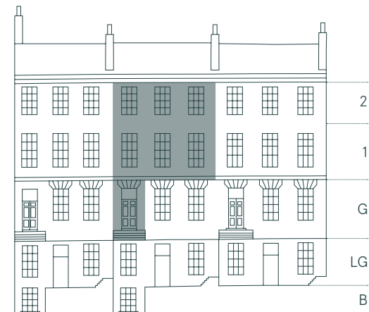
Ground Floor Entrance